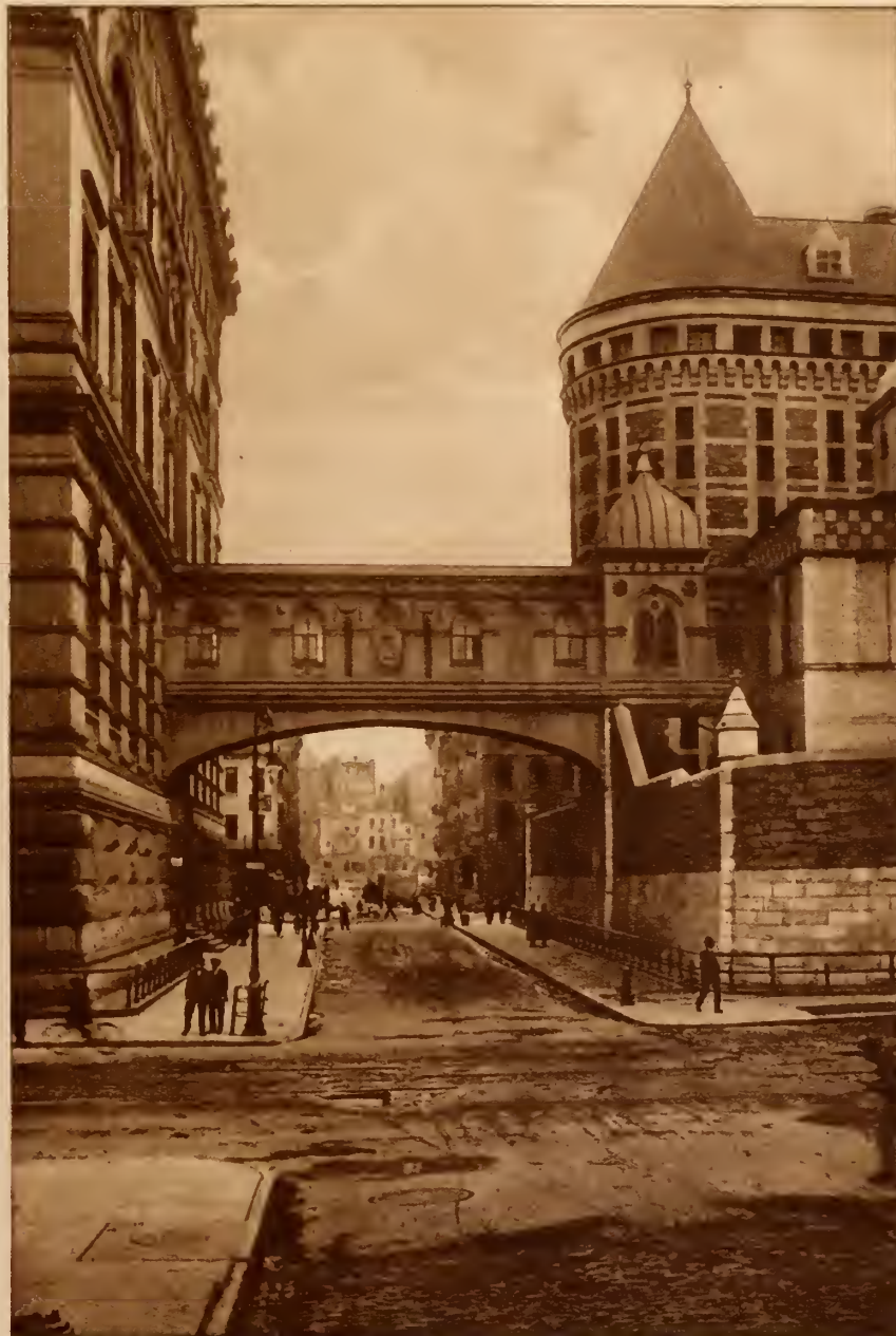
NEW YORK COUNTY BUILDING. Showing the Court of General Sessions at left and the Tombs prison on the right. Also a glimpse of New York's "Bridge of Sighs."